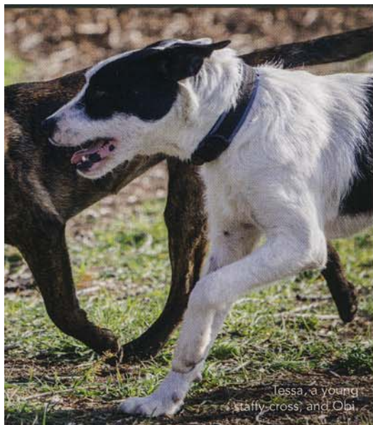
Tessa, a young staffy-cross, and Obi.